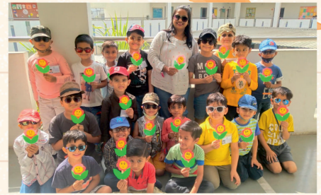
Summer Day Celebration