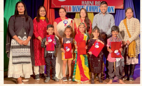
Solo Dance Competition