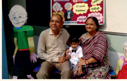
Grand Parents Day Celebration