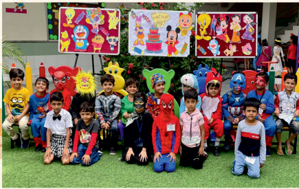
Cartoon Day Celebration