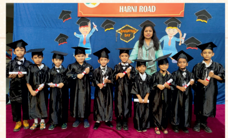
Graduation Ceremony Of Batch 2021-22