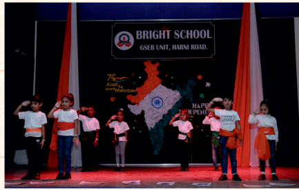
Azadi Ka Amrit Mahotsav 75 th Independence Day Celebration