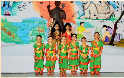
Maha Shivratri Celebration