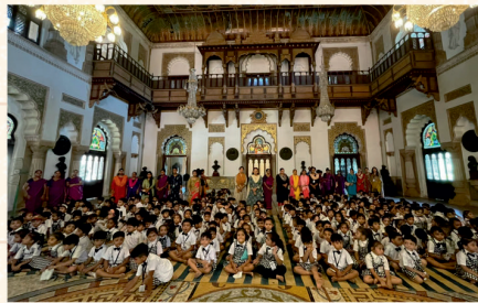
Ganesh Darshan @ Laxmi Vilas Palace