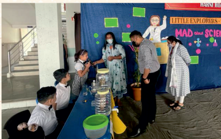
'Little Explorers' Science Project Exhibition