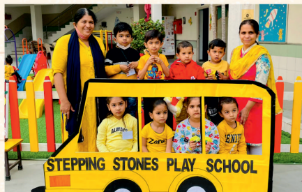
Yellow Color Day Celebration